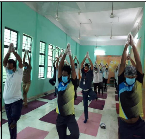
KLEF staff doing Standing Asanas on 21.06.2019