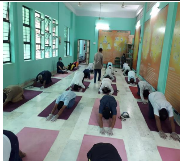
KLEF staff doing Kurmasana on 21-06-2019